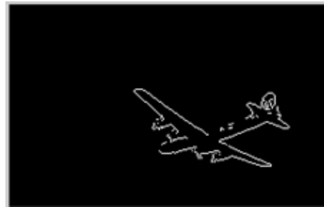
Figure 3: Boundary detected image

Figure3 shows the boundary detection. In this figure the boundary of the foreground object (In this case the foreground object is aircraft) is extracted from the background objects. The sobel edge detection method is used for this purpose.