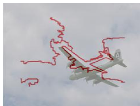
Figure 5: second round group image

Result of the first round perceptual organization. Notice that the different parts of the aeroplane have been grouped into two big pieces. These two big pieces are aligned. Bottom: final segmentation result after second round.