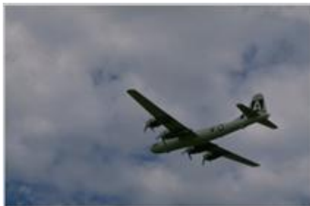
Figure 1: Input image

Figure1 shows the input image that is to be processed. Input image can be any one of the image formats JPEG, PNG and BMP. First the input image is passed to the MATLAB and then it is resized using a threshold value 0.5. This resized image is shown in the figure1.