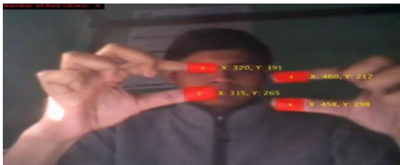
Fig. 7. Red Color Detection[22]

In color detection can be of various colors. To detect an object, color detection method can be used. In that any color can be used. We can consider red color. In red color tap technique, finger wrapped with the red color tap is to be detected. As the finger moves on the locations of the different numbers, that particular number is detected. This similar way is used to detect numbers and enter the password. In this technique, it detects the position of the finger and the centroid of red color part.