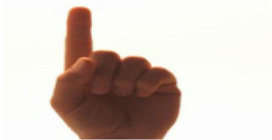
Fig. 4. Finger for non touch enable technology[1]

Today's the era of non touch enabled technology. Non touch enabled technology is the one in which user is expected to give input without touching machine interface. [1]User can also give input through any color tape on the finger. In Non touch enabled technology, mainly Hand Gesture is used to interact with the machines. Gestures are a form of non verbal communication which is in trend since humans born. Finger for non touch enabled technology is shown in fig.4.