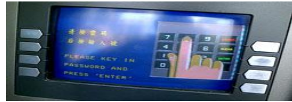
Fig. 5. Virtual Password [19]

Yet, it is possible by recording screenshots at regular intervals or upon each mouse click.