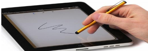
Fig. 3. Stylus technology[15]

A stylus is one type of a writing utensil, or a small tool for some other form of marking or shaping. [14] Forsline and Pederson came up with a stylus to use a pen kind e-stick to draw or write on a computer screen which changes the world of communication with the computers. [1] It can also be a computer accessory that is used to assist in navigating or providing more precision when using touch screens. [14] Fig.3 shows stylus technology.