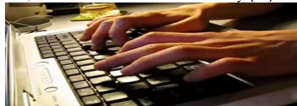
Fig. 1. Computer keyboard typing technology [11]

for data entry and storage purpose. Still to the present, Keyboards remain central to human-computer communication even as mobile devices such as smart phones and tablets adapt the keyboard as an optional virtual, touch screen-based means of data entry. [10]