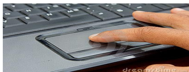
Fig. 2. Touch pad technology [13]

The Apollo desktop computers were equipped with a touchpad on the keyboard by 1982. Touch pads began to be initiated in laptops during 1990s. [12] Fig.2 shows the touchpad technology.