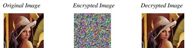
Fig 1: Encrypted Image Analysis

Encryption is carried out with the input of three different hexadecimal values, session key and user input which does encryption onto each of the three different planes. The use of chebyshev mapping and 2-D Arnold cat map provides much confusion and diffusion which makes this method more secure .Decryption will be unsuccessful if either of the keys are wrong or if one plane key is incorrect. This system becomes highly sensitive to a small change of data. As the chaos becomes three dimensional, more effective encryption is carried out.