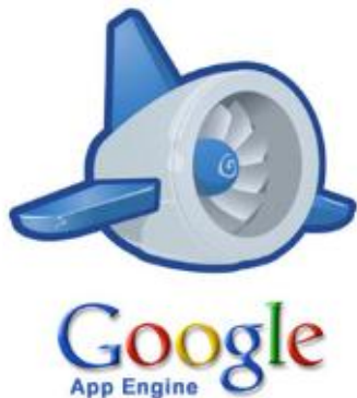
Fig. 1. Google App Engine Logo

Google App Engine is a Platform as a Service(PaaS). It is a Cloud Computing platform for developing and hosting web applications in Google-managed data centers. It offers automatic scaling for web applications. As the number of requests increases for an application, App Engine automatically allocates more resources for the web application to handle the additional demand.