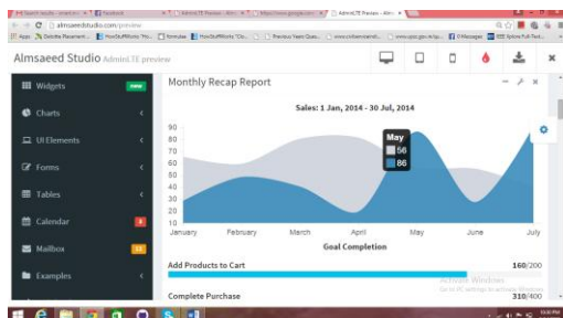
Figure 2: Dashboard Representing Comparative Reports for better Human Readability

Data visualization is viewed by many disciplines as a modern equivalent of visual communication. It is not owned by any one field, but rather finds interpretation across many (e.g. it is viewed as a modern branch of descriptive statistics Data vi Data visualization or data visualization is viewed by m Data visualization or data visualization is viewed by many disciplines as a modern equivalent of visual communication. It is not owned by any one field, but rather finds interpretation across many (e.g. it is viewed as a modern branch of descriptive statistics by some, but also as a grounded theory development tool by others). It involves the creation and study