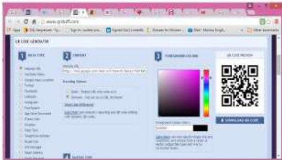
Fig2. Generating QR Code using "QRStuff"