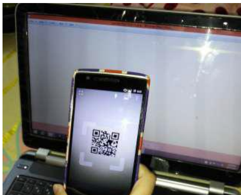
Fig.4 Scanning of QR Code