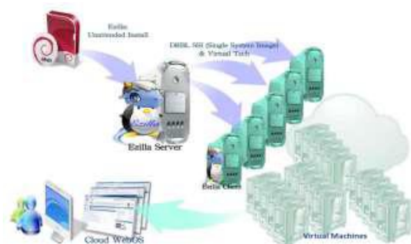
Fig1. Private cloud creation process on Ezilla

There are four key Widgets that consist of Image Creator Widget, VM Creator Widget, VM Monitor Widget, and VM Control Widget in Ezilla. Due to users have a graphical user interface, users can simply and intuitively manage all of these widgets in Ezilla. According to user's requirements, user can adopt the particular Widgets to arrange their complicated computing tasks via Ezilla Toolkit.