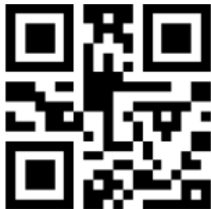
Fig. 3 Generated 2D Dynamic QR Code