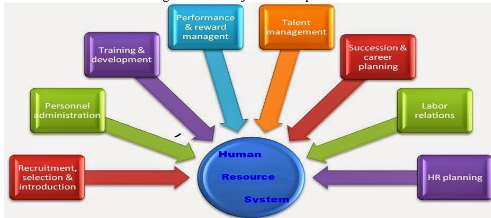
Figure No. 1. Major HR components

signs of growth or at least a form of stabilization, HR departments everywhere came to realize that technology support has fundamentally changed and it's time to act. What's different this time is that new HR technology is not meant to make the HR department more efficient, but focuses beyond HR, to increase the user experience, to add value across the business, and to improve competitiveness. The role of the HR professional has changed fundamentally as a result of technology. The core competencies that have developed are mastery of HR technology, strategic contribution, personal credibility, HR delivery, and business knowledge.