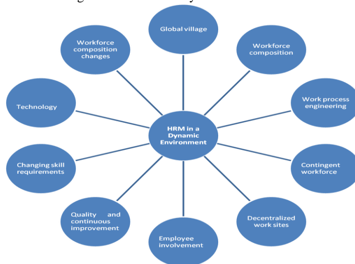
Figure No.4 HRM in dynamic environment

Technology and HRM have a broad range of influences upon each other, and HR professionals should be able to adopt technologies that allow the reengineering of the HR function, be prepared to support organizational and work-design changes caused by technology, and be able to support a proper managerial climate for innovative and knowledge-based organizations. In addition, the effective use of technology can enable organizations to track employees and reach out when required. Today the social networking sites viz. facebook, twitter, LinkedIn etc. are used as an innovative tool to recruit the capable and efficient human resources in any organization. Technology is moving beyond its role as a business enabler and become further ingrained in the life and work styles of the future workforce, while also changing employee and