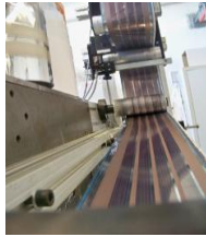
Fig:2 Printed solar cell

Our printed paper photovoltaics reduce not only production costs but also material costs.