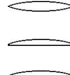
Fig: 3 convex lens

particular lens. After checking all range of lenses we selected 40, 50, and 60 focal length lens.