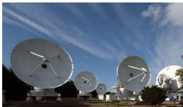
Fig.2 Nobeyama Radio Observatory

This telescope has been used to observe large solar structures, such as the polar brightening or prominences. The large diameter of the telescope enabled us to observe, for the first time, a sunspot with enough spatial resolution to distinguish the sunspot umbra from the other regions at millimeter range. Solar filter was used to enable us to prevent saturation of the receivers.