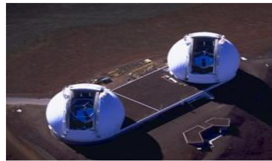
Fig.6 Keck Observatory

The W. M. Keck Observatory is a two-telescope astronomical observatory at an elevation of 4,145 meters (13,600 ft) near the summit of Mauna Kea in the U.S. state of Hawaii. The two telescopes feature a highly capable suite of advanced instrumentation for both optical and near-infrared wavelengths, including imagers, multi-object spectrographs, high-resolution spectrographs, and integral-field spectroscopy. 10 m (33 ft) primary mirrors, currently among the largest astronomical telescopes in use [12].