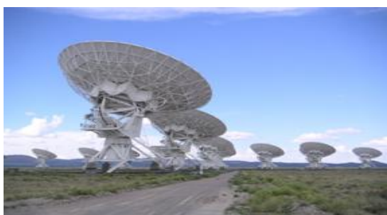
Fig.3 Very Large Array (VLA)

Each of the massive telescopes is mounted on double parallel railroad tracks, so the radius and density of the array can be transformed to focus on particular bands of wavelength. Maximum bandwidth in each polarization is 0.1GHz and maximum number of frequency channels 512 are used[8].