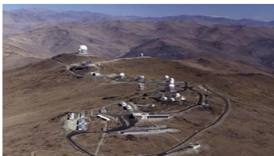
Fig.4 la Silla Observatory

The La Silla Observatory is an astronomical observatory at an elevation of 2,400 meters (7,874 ft) in Chile with three telescopes built and operated by the European Southern Observatory (ESO).