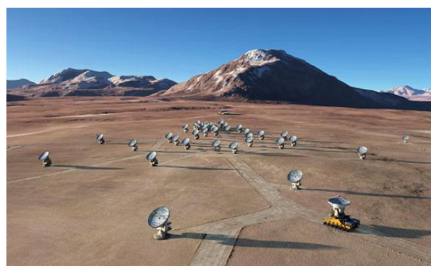
Fig.1 ALMA Telescope

It's designed to spot some of the most distant, ancient galaxies ever seen, and to probe the areas around young stars for planets in the process of forming. The site search process resulted in the selection of a very high, dry site in northern Chile at 5000m elevation. At this site, the water vapor in the atmosphere is minimal, and observations at frequencies up to 950 GHz (and even higher) are feasible. Also, the site is close to a paved highway and access is easy.