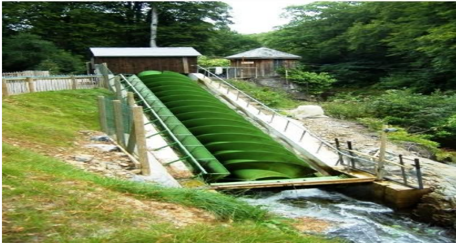
Fig.3 Installation of turbine