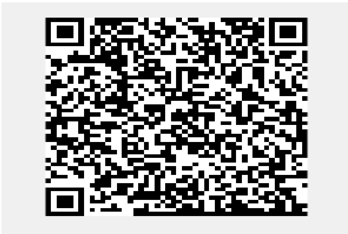
Fig.4. Blue channel QR code

Message data B plane is: 'my project qr code'