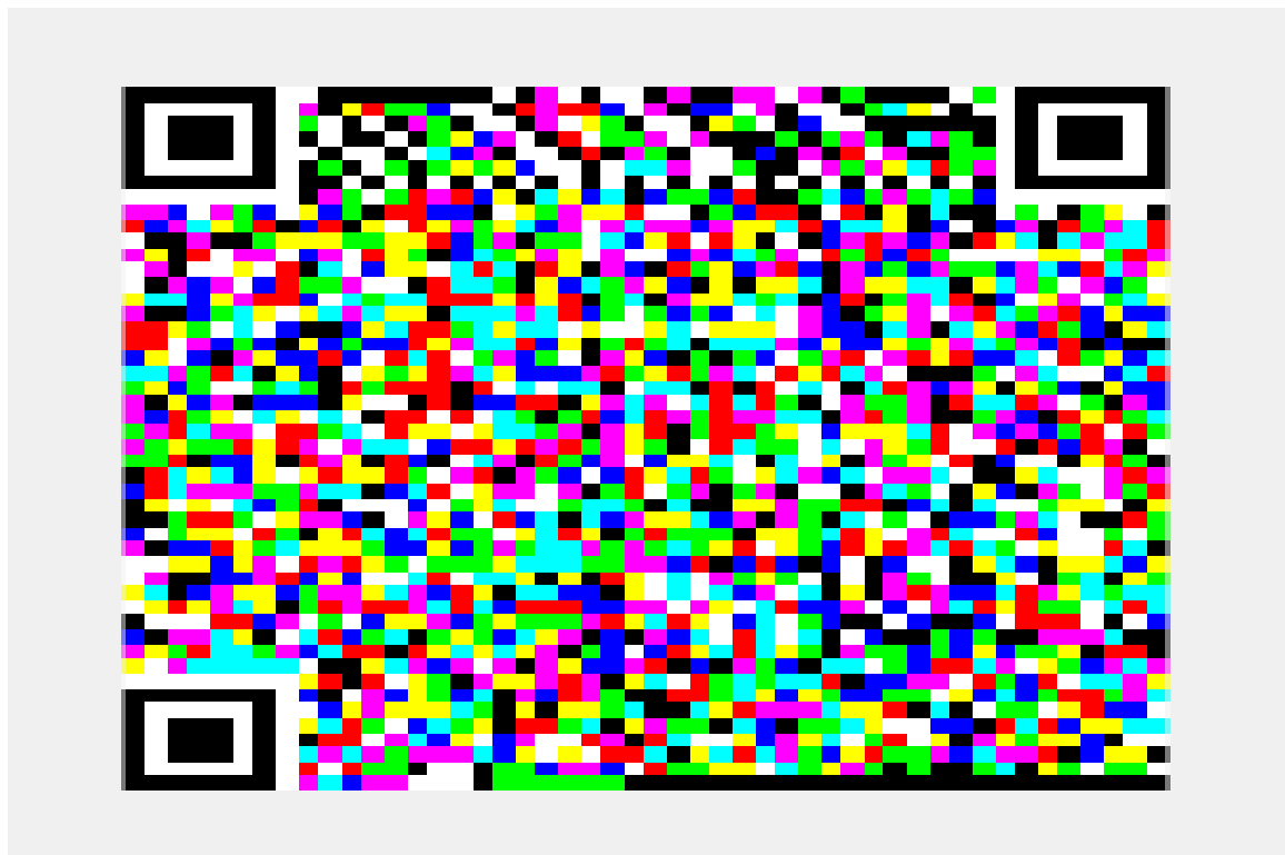
FIG.5. 3-D QR CODE