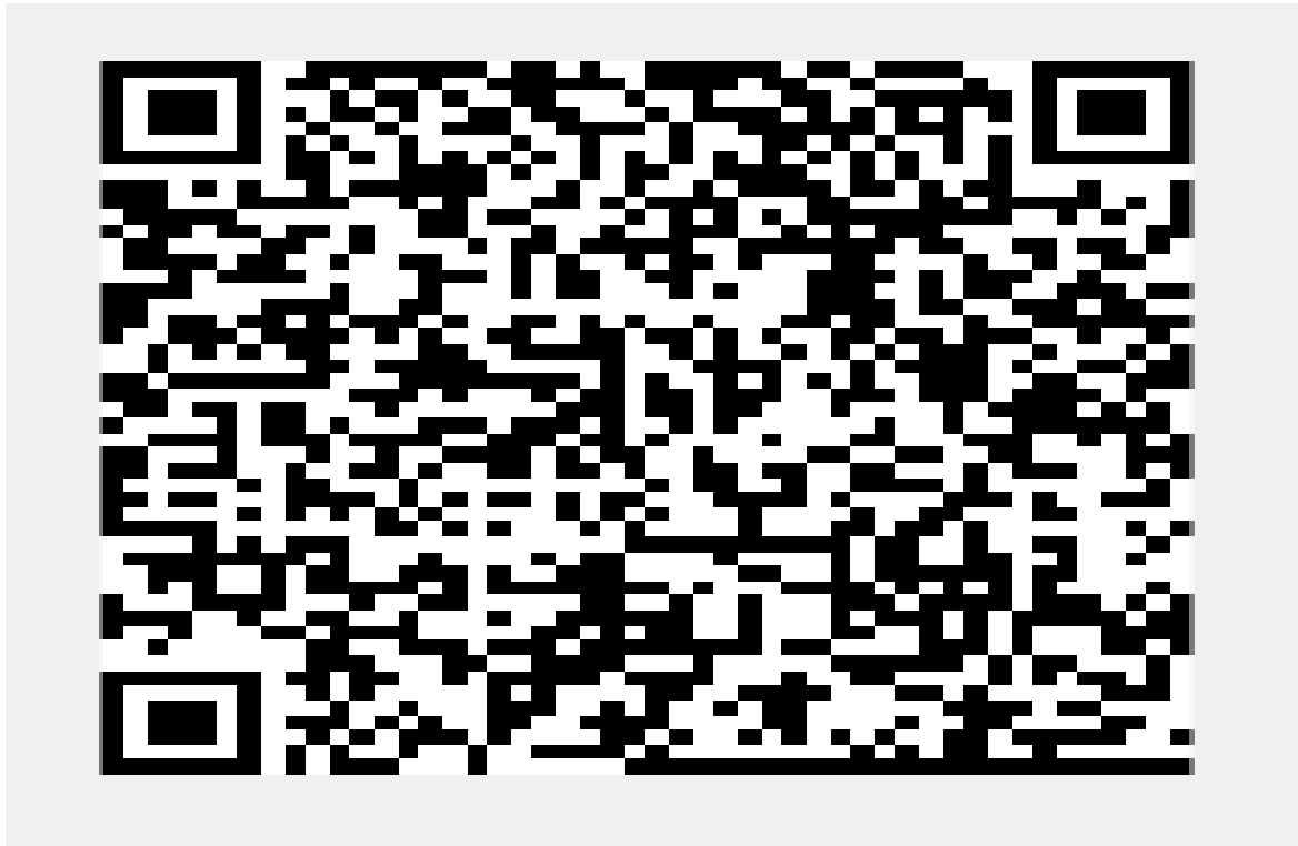
Fig.3. Green channel QR code

Message data B plane is: 'my project qr code'