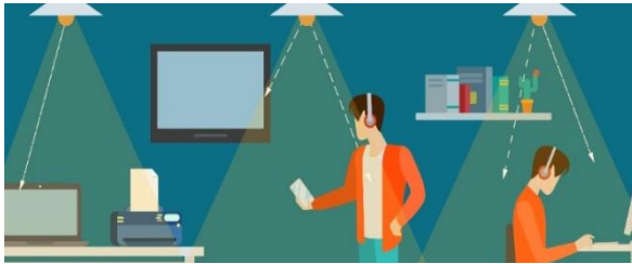
Fig.2. Uses of Li-Fi [11]