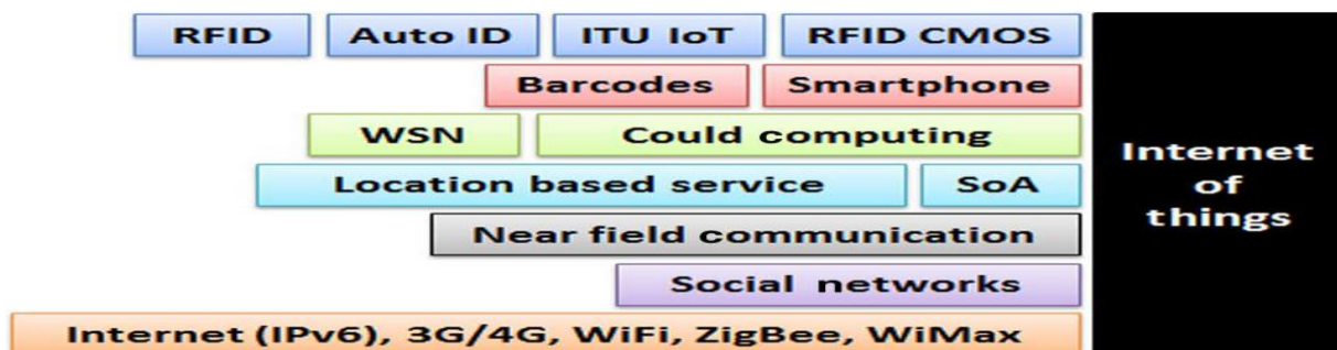
Fig.1. Technologies associated with IoT.

IoT technologies include many other technologies and devices such as barcodes, smart phones, social networks, and cloud computing are being used to form an extensive network for supporting IoT which are shown in the following diagram [5]–[8].