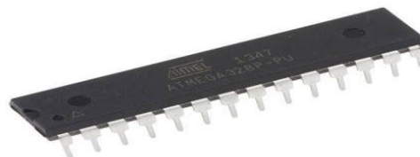
Fig. 2 ATmega 328 chip

Arduino is an open source computer hardware and software company, project and user community that designs and manufactures single-board microcontrollers and microcontroller’s kits for building digital devices and interactive objects in the physical world. Arduino boards are available commercially in preassembled form, or as do-it-yourself kits. Arduino board designs use a variety of microprocessors and controllers. The boards are equipped with sets of digital and analog input/output (I/O) pins that may be interfaced to various expansion boards and other circuits.