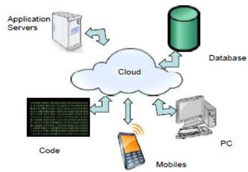
Fig. 1 A Cloud Computing Environment

A consumer can unilaterally provision computing capabilities, such as server time and network storage, as needed automatically without requiring human interaction with each service's provider.