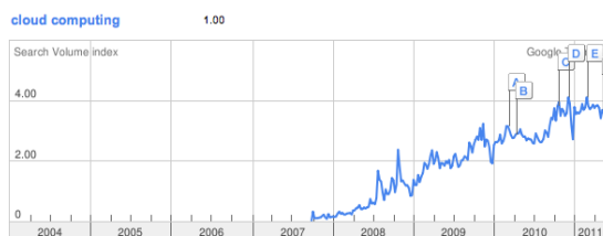
Fig.1: Searches for 'cloud computing' on Google.com

Many of today's services rely on efficient access to computing services. Cloud computing has recently reached popularity and developed into a major trend in IT. Industries have been researching the Cloud research agenda for a long time; academia has only recently joined, which can be seen through the sudden rise in workshops and conferences which focus on Cloud Computing. In response to the resulting demand for flexible computing resources, cloud computing has taken the IT industry by storm over the past few years. The term "Cloud Computing" became famous in 2007, when IBM and Google announced research in this field, and later on, IBM announced "Blue Cloud" effort[1]. A key element of cloud computing is the creation of a user-defined experience. Cloud computing users avoid capital expenditure on hardware, software, and services and they pay the provider only for what they use.