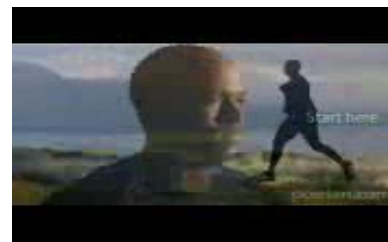
Figure-4 Dissolve effect