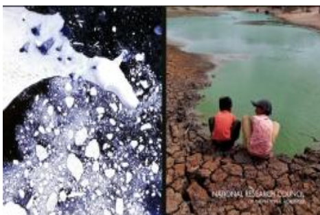
Figure-1 hard cut effect