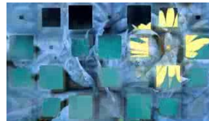
Figure-3 Wipe effect

The foremost requirement of any multimedia industry is video. Over the years industries has developed comprehensive and complete measures and techniques to index, store, edit, retrieve, sequence and present video material. Shot boundary detection is usually the opening step toward automatic video indexing and browsing. It is based on the recognition of visual discontinuities caused by the transitions, to segment a video stream into elementary uninterrupted content units for subsequent high-level semantic analysis. The discontinuities usually found during scene change or shot change. These discontinuities occur in form of transitions of different kinds which are categorised into two groups: abrupt (as hard cut) and gradual (dissolve, fade in, fade out, wipe). Conventionally, if there exist frames that are merged by the adjacent shots but belong to neither of them, the transition is called a gradual one; otherwise, it is called a cut.