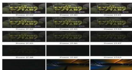
Figure-2 fade effect