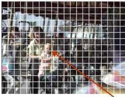
Figure-6 illustration of statistical difference

pixels in those regions between successive frames using statistical computation parameters.