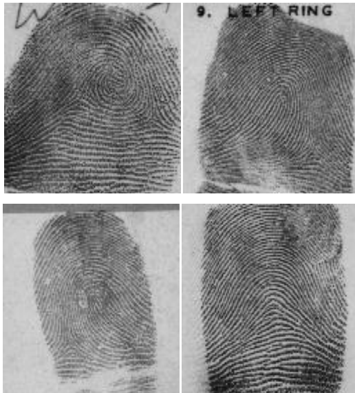
Figure 3: Different fingerprint patterns

A fingerprint image exhibits a quasiperiodic pattern of ridges (darker regions) and valleys (lighter regions). The local topological structures of this pattern together with their spatial relationships determine the uniqueness of a fingerprint.