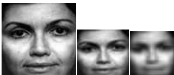
Fig.3: first level of granularity by applying Gaussian operator.

In the third level of granularity is done by dividing the image into 16 granules based on the golden ratio template algorithm Fig.6. The human face golden ratio means the most beautiful face ratio. It has three parts that mean from hairline to eyebrow, from eyebrow to nose and from nose to chin. In this level the faces are divided according to these three parts. Here the human face golden ratio is used to define the facial feature size.