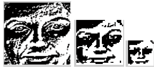
Fig.4: first level of granularity by applying Laplacian operator.