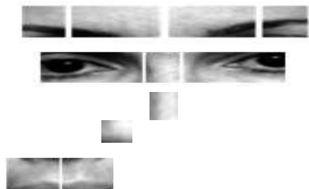
Fig.6: third level of granularity