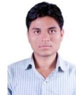
Dr.N.P. HiraniInstitute Polytechnic, Pusad, Yawatmal in MSBTE.