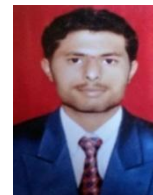
B.MPolytechnic,Solapur in MSBTE.