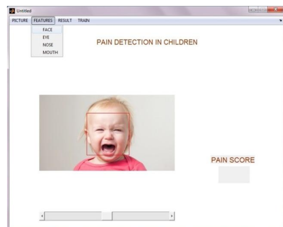
Figure 4.1 Face Segmentation

A feature is defined as an interesting part of an image. Once features have been detected, a local image patch around the feature can be extracted. This extraction may involve quite considerable amount of image processing [11].