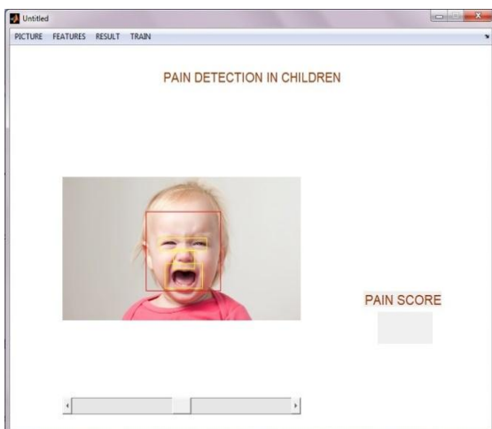
Figure 4.4 Mouth Segmentation

The result is known as feature descriptor or feature vector. Eye pair width, nose width, distance between eye and mouth, and mouth width are the features extracted here. In this work, we have used 20 images for training our system.