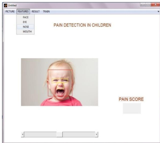
Figure 4.3: Nose Segmentation