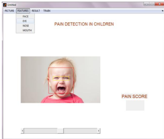
Figure 4.2 Eye segmentation