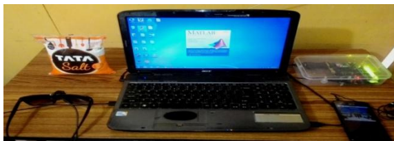
Fig1. Top View of Proposed system

Here in project we modified with the existing system. In this we used LPC 2148 ARM based microcontroller which is interfacing with the LCD and MAX 232 IC and also instead of VOICE IC 9600 we used android application which used in android mobile. Because of this blind person can use this system at specific distance and read the information of packaged product.