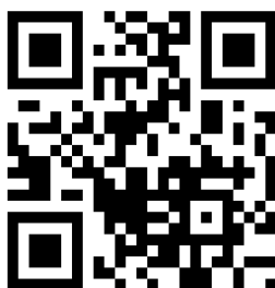
b. QR code

QR codes those wacky square bar codes that your phone's camera can read can be made extremely useful. Instead of requiring us to type in a long URL, we can point your phone at a QR code and automatically launch a web page. Instead of giving a guest your complicated Wi-Fi password, just log them in via QR code. Instead of worrying about key loggers, you can sign into web sites via QR code and many more.