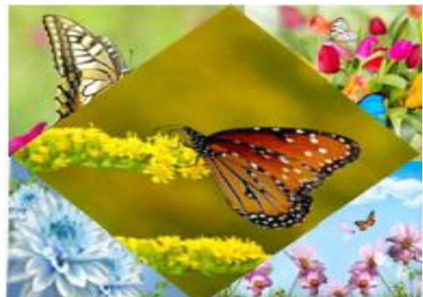
Fig. 2.Example of Grid with Customizable Patterns