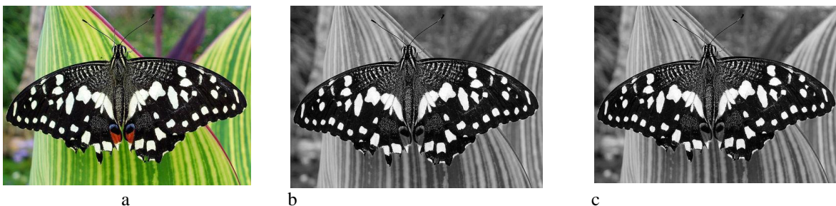
Fig. 3. a. Original Image [5] , b. Result of Averaging Method, c. Result of Vector Method (Original Image Courtesy: OpenCV Samples)