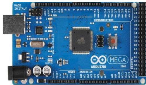
Fig. 1 Arduino Mega is used as the central computing unit to which all the inputs are given and the output is taken.

This Arduino acts as the central computing unit in this project. It controls the main units of ATV i.e., the location detection unit, navigation and driving unit and obstacle sensing unit. A Display unit is present so as to display the output information from the Arduino board.