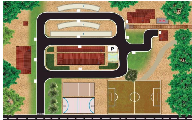
Fig. 3 Overview of the campus.

because it radiates at infrared wavelengths, but it can be detected by electronic devices designed for such a purpose. The term passive in this instance refers to the fact that PIR devices do not generate or radiate any energy for detection purposes. They work entirely by detecting the energy given off by other objects. PIR sensors don't detect or measure "heat"; instead they detect the infrared radiation emitted or reflected from an object. A PIR-based motion detector is used to sense movement of people, animals, or other objects. An individual PIR sensor detects changes in the amount of infrared radiation impinging upon it, which varies depending on the temperature and surface characteristics of the objects in front of the sensor. When an object, such as a human, passes in front of the background, such as a wall, the temperature at that point in the sensor's field of view will rise from room temperature to body temperature, and then back again. The sensor converts the resulting change in the incoming infrared radiation into a change in the output voltage, and this triggers the detection. Objects of similar temperature but different surface characteristics may also have a different infrared emission pattern, and thus moving them with respect to the background may trigger the detector as well. PIRs come in many configurations for a wide variety of applications.