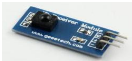
Fig. 4 This is the IR Sensor used so as to keep the ATV in its path. It senses the path and will align the wheels in the desired direction by sensing the black colour on the path and it stops when senses white.

To find the shortest path, Dijkstra's Algorithm is used in this project. Dijkstra's algorithm is an algorithm for finding the shortest paths between nodes in a graph. A more common variant fixes a single node as the "source" node and finds shortest paths from the source to all other nodes in the graph, producing a shortest-path tree. For a given source node in the graph, the algorithm finds the shortest path between that node and every other. It can also be used for finding the shortest paths from a single node to a single destination node by stopping the algorithm once the shortest path to the destination node has been determined. Here each node represents the RF- ID tag placed in each location hence finding the shortest distance required.