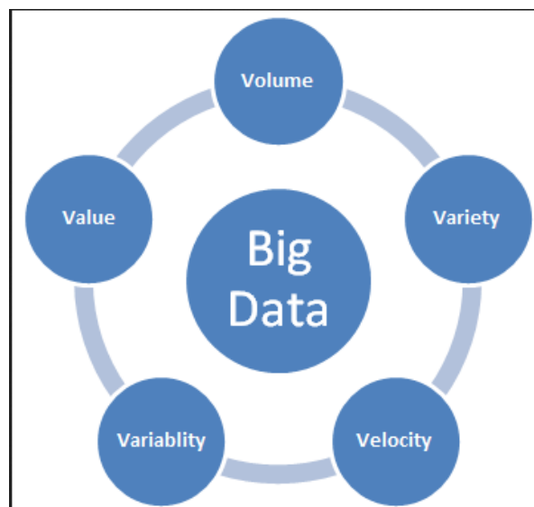
Figure 1: Main attributes of big data

As portrayed in Fig. 1, the ordinarily talked about traits of enormous information are [13]: (I) volume, (ii) assortment, (iii) veracity, (iv) speed, and (v) esteem. The initial two characteristics, i.e., volume and assortment, reflect to the equipment and programming prerequisites in taking care of enormous heterogeneous informational indexes while the highlights veracity and speed convert into the continuous preparing capacity with adequate reliability. Then again, procurement of the most noteworthy helpful incentive from the complex enormous informational indexes in remote IOT systems requires interdisciplinary collaboration among the scholarly community, undertakings and remote ventures.