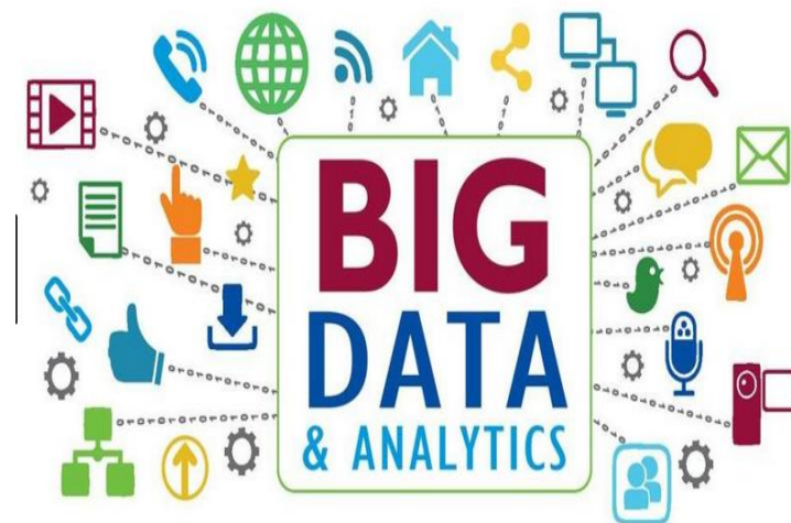
Figure 2: Main technology enablers for big data analytics

Figure 2 represents the key innovation empowering influences for huge information investigation. Stochastic models are probabilistic models and are normally used to catch the unequivocal highlights and flow of the information activity. The ordinarily utilized stochastic models are Markov models, time arrangement, geometric models, and Kalman channels. Then again, information mining approach tries to remove certain data from the informational indexes and change this data to a known structure for encourage use by utilizing reasonable peculiarity recognition, order, bunching, and relapse investigation strategies.