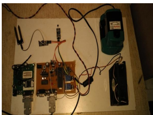
Fig. 1. Example of an image with acceptable resolution