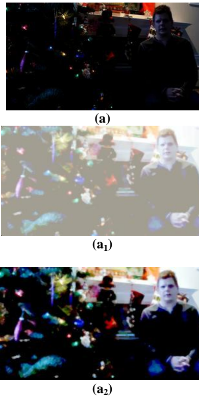
Fig. 3: Enhancement result- (a): low light video, (a 1 ): By Histogram Equalization, (a 2 ): By Weber's Law

The proposed method produces convincing results on a lot of videos, including videos with fast moving objects and the standard test videos. The enhancement results of the proposed algorithm with and without noise are shown in Fig.3.