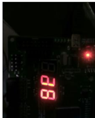
Fig 4: Clear view of the output