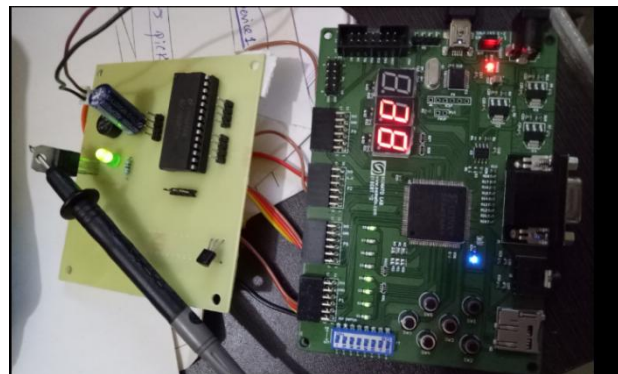
Fig 3: 7 Segment display showing the output