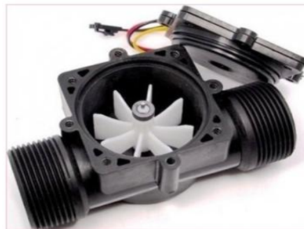
Fig. Flow Sensor

Flow sensor works on Hall Effect method. It acts like simple frequency counter. It produces a series of pulses which are proportional to instantaneous flow rate. The equation of flow rate of fuel can be shown as follows: