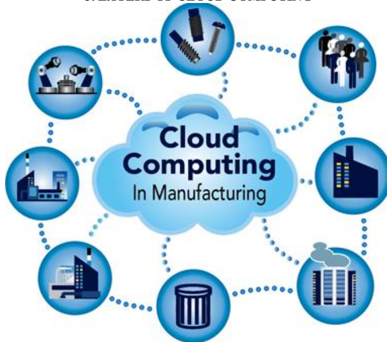
Fig1.cloud for everyone