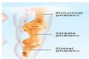
Fig. 1 Finger Knuckle Anatomy

Each finger has three joints .There are three bones in each finger called the proximal phalanx, the middle phalanx and the distal phalanx.The first joint is where the finger joins the hand called the proximal phalanx. The second joint is the proximal interphalangeal joint, or PIP joint.