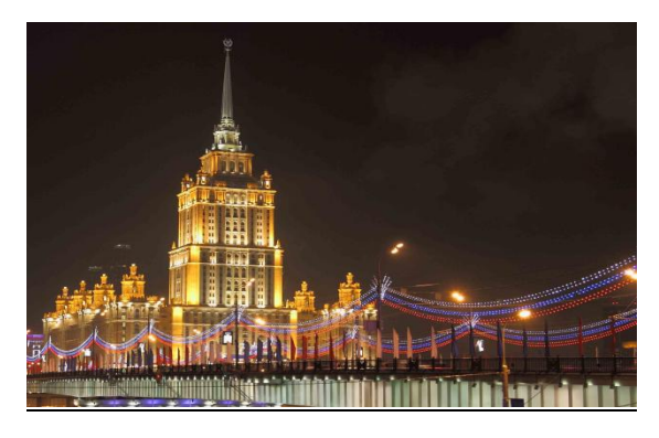
Fig 5-Image At Q Factor 30