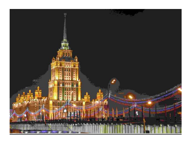
Fig 4-Image At Q Factor 1