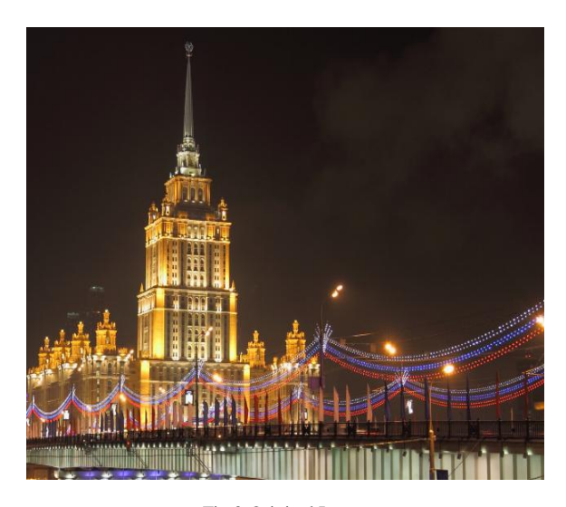
Fig 3-Original Image

obtained, shown below in fig4, fig5, fig6 for various values of Quality factor=1, 30, 90 respectively.