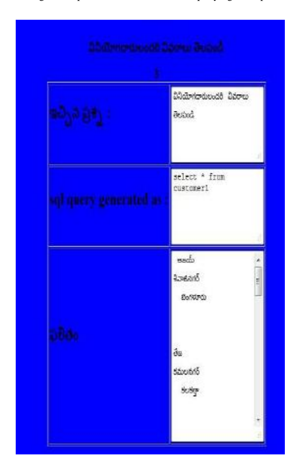
Fig. 2 Result generation

an image with acceptable resolution Copyright to IJARCCE