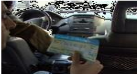
Fig 12: Check Flight details

Whenever a user wants to check the flights or an item in a store, the sixth-sense provides radio frequency which will scan the RID tag (like barcode, or QR code) & receive the relevant information. The information will be displayed on the surface.