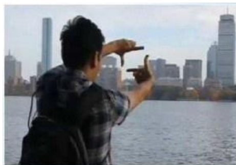
Fig 9: Taking Pictures

With just the movement of hand gestures, user can take the pictures. Webcam recognizes the gesture & the framing to which the user is pointing to, this particular recognized frame will be stored in the mobile component. & can be displayed on to any particular surface by using projector.