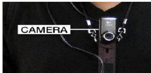
Fig 3: Camera

The main objective of the camera is to capture the images and recognizes the hand movements, This is processed to the mobile component device for further processing.