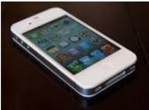
Fig 7: Mobile Component

Sixth-Sense consists of a web enabled mobile component. The component is web enabled because the data collected is processed to the mobile and in turn mobile uses the web to get the information. Either information is stored in the component or is displayed to the user through projector.