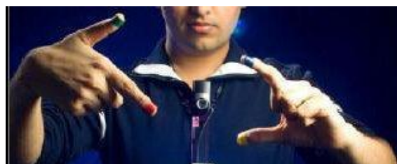
Fig 4: Colored Markers

These colored markers are placed at the tip of the user fingers. This helps the webcam to identify the movement of hand and the gesture recognition.