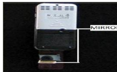
Fig 6: Mirror

The usage of a mirror is important as the projector dangles pointing downward from the neck. The mirror reflects the image on to a desire surface. Thus finally the digital image is viewed in the physical world.