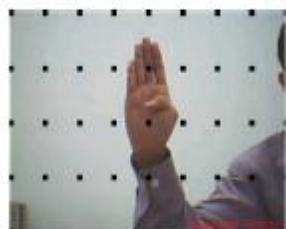
Fig 2: Generation of Fine towers

Gesture Recognition: It is a technology which is used to identify human gestures with the help of mathematical algorithms. Gesture recognition recognizes the hand, tracks the hand movements & also provides information about hand position orientation and flux of the fingers.