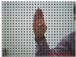
Fig 1: Generation of coarse towers

There are two kinds of the towers. The first kind is called the coarse tower & the second kind is called as fine towers.