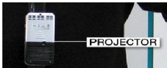
Fig 5: Projector

The Projector displays, which is gathered from a smart phone or any application device, on to any particular surface.