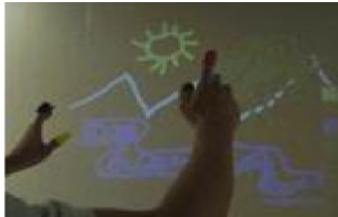
Fig 10: Drawing.

The drawing application allows the user you to draw on any surface by tracking the fingertip movements of the user's index finger. The pictures that are drawn by the user can be stored and replaced on any other surface. The user can also shuffle through various pictures and drawing by using the hand gesture movements.