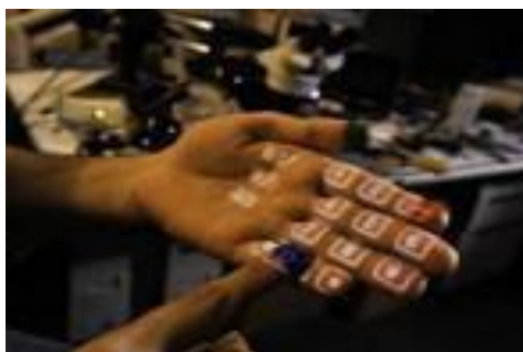
Fig 11: Making calls

The Sixth Sense device is used to project the keyboard into your palm and the user can make the calls using this virtual keyboard.