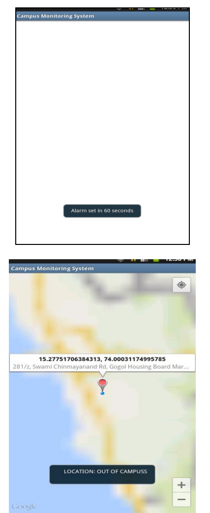
Fig. 2 Snapshot of Mobile Application after Installation on the Android based Phone

As soon as Mobile Application is installed and started for the first time it will ask to enter his roll no. which is unique code as primary key for database will be added to server database and by default keep the status as unknown.