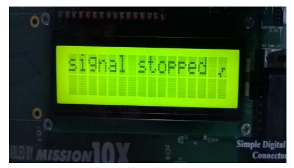
Fig-6: Signal Stopped

International Journal of Advanced Research in Computer and Communication Engineering Vol. 3, Issue 11, November 2014