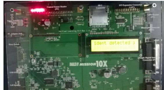
Fig-5: Accident Detected