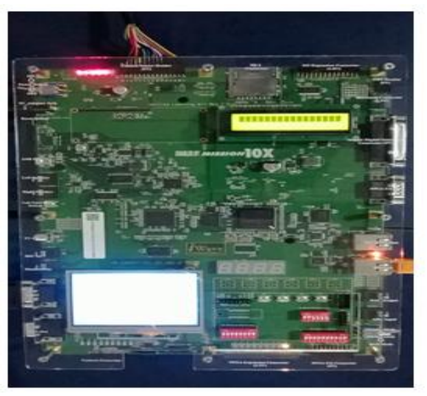
Fig-4: UTLP Kit