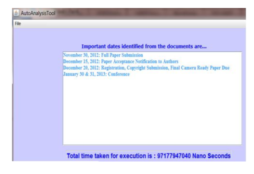
Fig.3. Extracted information – important dates