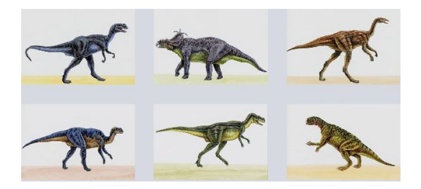
Fig 5.2(b) Result after TEFC Comparison