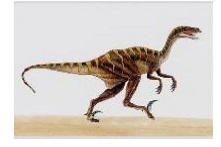
Fig 5.1 Input query image

After calculating CCV and TEFC features for each image, features of query image and database images are compared. According to the feature comparison, distance between query image and database images is calculated and stored in ascending order. This result is shown below. Fig 5.1(a) shows the result after color feature comparison. Fig 5.1(b) shows result after the texture feature comparison.