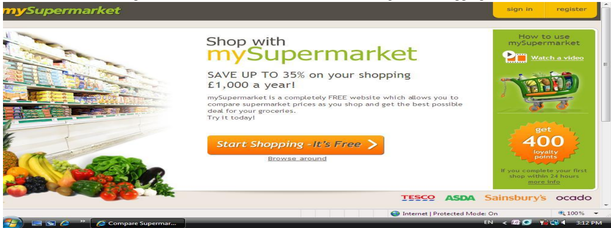
Fig-1 My Supermarket website

Appropriate choice of fonts and colors Font types are appropriate and easy to read. Choice of coloures for both fonts and background is appropriate, combination of