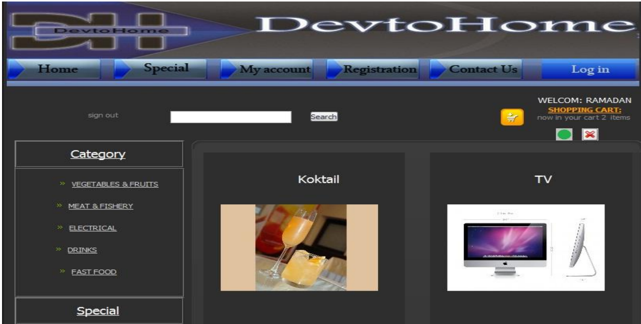
Fig-4 New Designed Website (Devtohome )