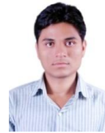
Dr. N.P. Hirani Institute Polytechnic, Pusad, Yawatmal in MSBTE.