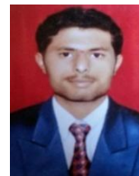
B.M Polytechnic, Solapur in MSBTE.