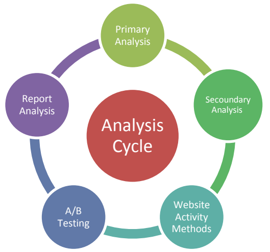
Figure 1: SEO Analysis Cycle

SEO analysis method has definitive steps using which you can thoroughly gauge the current state of your website and come up with the right plans to bring in business growth through online resources.