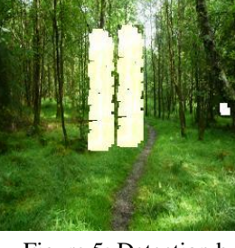
Figure 4: Detection by