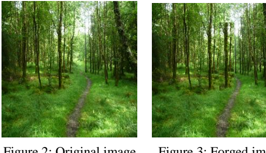
Figure 2: Original image

Visual results reveal that DWT as well as DCT both provide better detection result.DWT with small block size and reduction in time complexity is able to produce almost better visualization of the forged area.Detection accuracy is slightly more in case of DWT method as compared to DCT one.