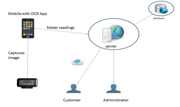
Fig1.System architecture of proposed system

We are developing the Solution for meter reader and a web portal for customer. By using Android application, reader will get the meter reading. Meter reader carries handheld device [1] with android Operating system in which our android application is installed.