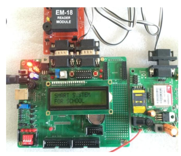
Fig. 4 Overall setup of system

The working principle of this system is divided into two parts that is each student carries a card which contains an unique identification number, now when the student enters the school bus, before that he should scan his card, for that are two switches one is for arrival and another is for safe departure, so while living from home to school the student will need to press the arrival switch and then enter in the school bus, now as soon as he will scan the card a message will be send through GSM to his parents that their child has went to school.