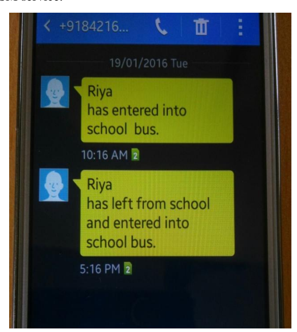
Fig.5 The Parent notification messages

The RFID and GSM are connected with ARM microcontroller and varying data is send to GSM modem which is simultaneously displayed on LCD and also message to parents. Through this experiment and implementation we came to know that the student can be [5] monitored using RFID and sent the status as SMS to the particular mobile successfully. System can be controlled via short message service from anywhere that covered by GSM service.