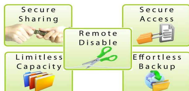
Fig. 2. iTwin Features