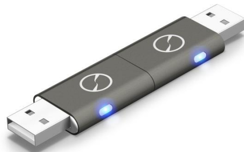
Fig 3. iTwin Device

Most of the mobile professionals and individuals that want to access their files and information in spite of where they are, select cloud services for backing up and storing important documents. A cloud service is suitable and enables you to access your files from some device with an Internet connection. Many cloud service providers deploy security technologies to guarantee their customers that documents are securely transmitted and stored. On the other hand, not anything is one hundred percent perfect that means a device like iTwin Connect can help you cover up all of your bases in the event of data break or loss.