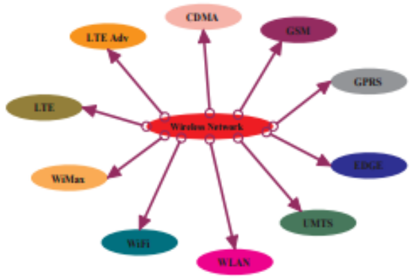
Fig. 3: Multiple wireless networks available are demonstrated

A mobile user who is streaming a music video on their (Personal digital assistant), or laptop. However, the smart phone while taking the bus to work will most likely demand for higher access speed multimedia leave the coverage area managed by one of its network communication in today's society, which greatly depends on computer communication in digital form at, seems one.