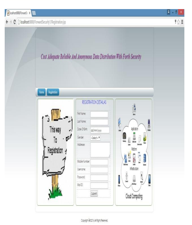
1. Registration Form

The entire process is described with screen shots of implementation.