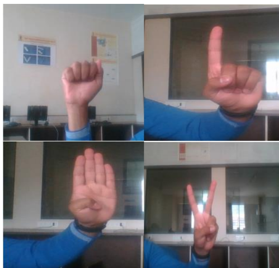
Fig.2 Sample image of 'signs'